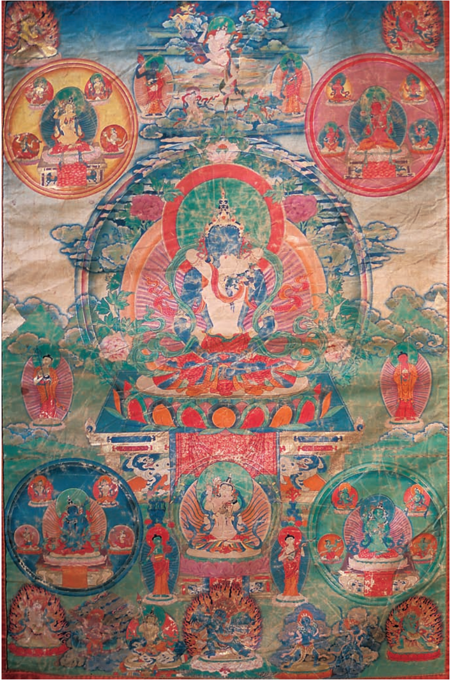
PLATE 4 SHITRO THANGKA PEACEFUL AND WRATHFUL DEITIES